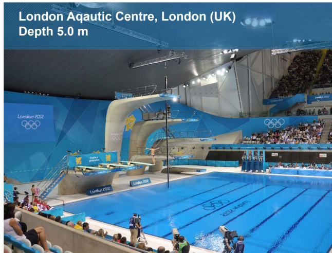
London Aquatic Centre, London (UK) Depth 5.0 m